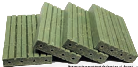
Photo may not be representative of a label-consistent bait placement.