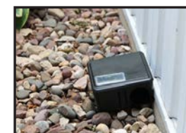
EXTERIOR OF HOMES

Must adhere to the USE RESTRICTIONS in the DIRECTIONS FOR USE section of this label.