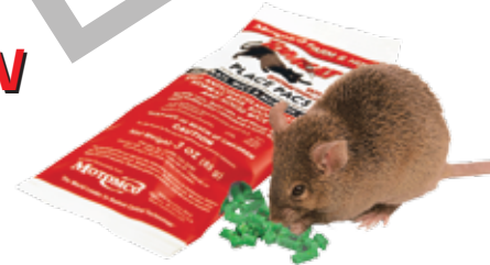
Photo is not representative of a label-consistent bait placement

This Product May Only be Used Inside and Within 100 Feet of Man-made Structures