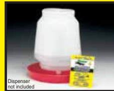
Dispenser not included

While wearing water proof gloves, using scissors, cut one 1.68 fl. oz. package open where indicated and pour the entire contents into a quart of water. Mix thoroughly.