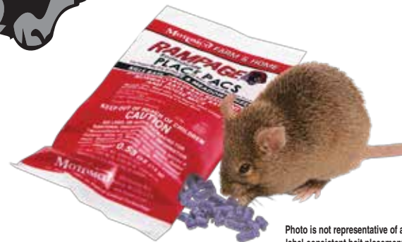
Photo is not representative of a label-consistent bait placement