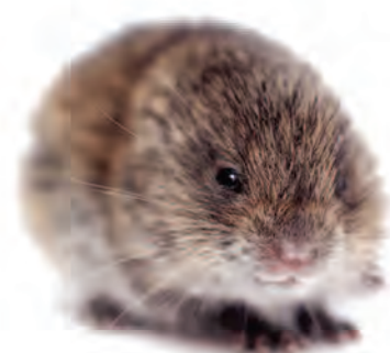
Meadow & Pine Voles