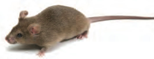
Rats & Mice