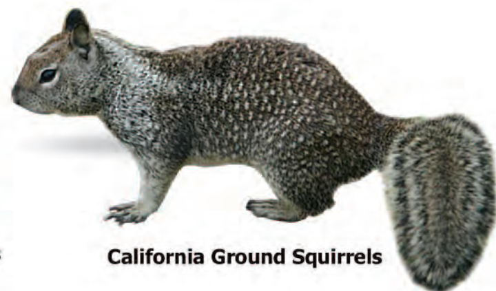
California Ground Squirrels