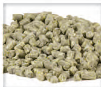
Durable pelleted bait formula