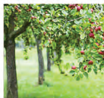
Approved for multiple orchard and fruit tree applications